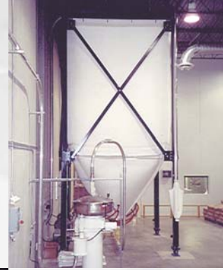
▲ 30 ton flour silo and sifter