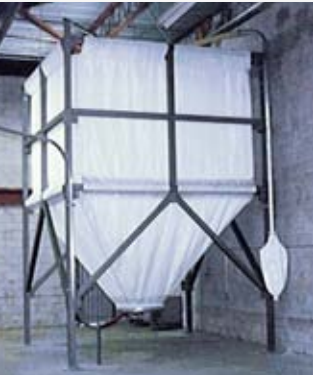
▲ Standard 25 ton silo

Bulk materials can be conveyed by negative and positive pressure systems.