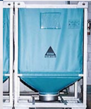
▲ 1000 kg sugar tote

A satisfied customer in Flat Rock, Michigan