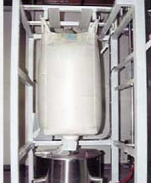
◀ A special tote transfer system for Masa Tortilla Flour (Los Angeles, CA.)