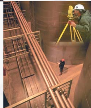
▲ Project management