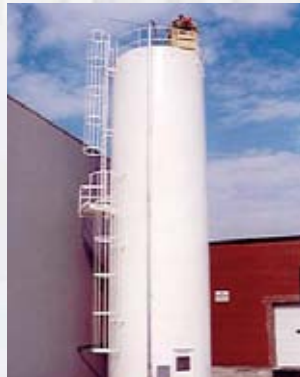
▲ 70 ton silo