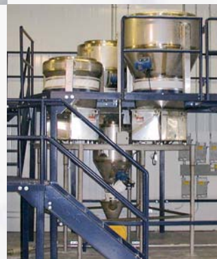
▲ A four station multi-ingredient system for accurate metering of yeast, sugar, flour and baking soda