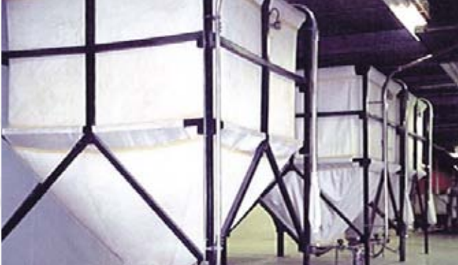
▶ Three 30 ton flour silos