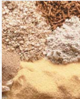
◀ Our silo systems have a proven record with a wide range of ingredients

Increase the Value of Your Business with Contemar Silo Systems.