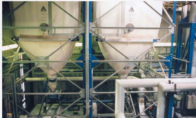
▲ Silo System for Sodium Bicarbonate

Everything the people at Contemar told us turned out to be true. The elimination of bulky bags has reduced our need for premium industrial space, and made back injuries from lifting heavy bags a thing of the past. We have no costs for the disposal of bags, making us good environmental neighbours. The Contemar Silo System paid for itself within the first two years and we have been thoroughly satisfied.