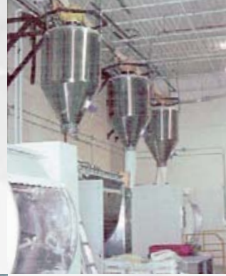
▲ Three 500 kg scale hoppers