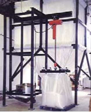
▲ 25 ton flour silo with sugar tote