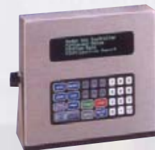
▲ Batching Computer

We integrate our silo systems with your current material handling configurations and provide simple to complex control systems complete with custom programming.